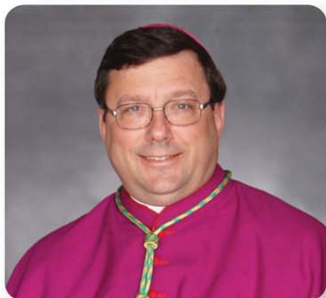
Keynote address by Bishop Lee Piché'

$30.00 in advance/$35.00 at the door (lunch included) $15.00 for religious and youth